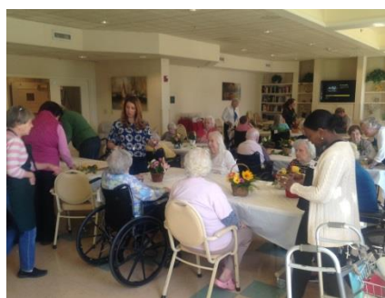
Garden Therapy at Wingate